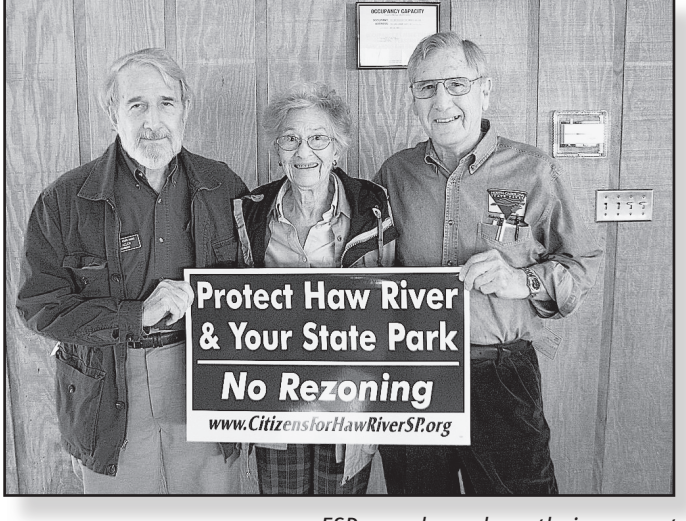
FSP members show their support

and family farming as part of the "preserves" instead of acres of grass to mow. We need visions and visionaries, courageous citizens and officials. The Haw River folks did it: so can we.